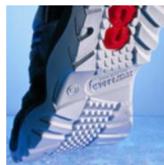
Sports and Leisure